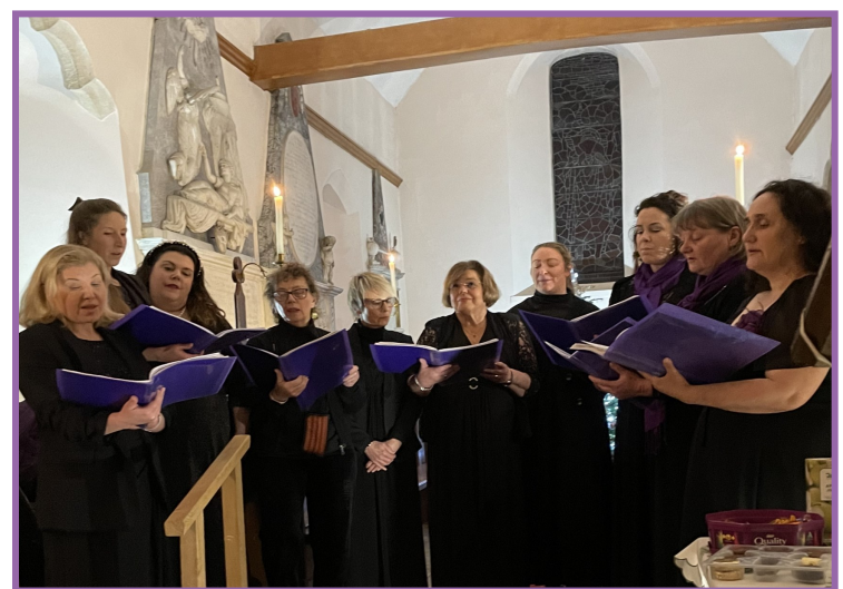
Military Wives Choir at St. Mary's, Buscot