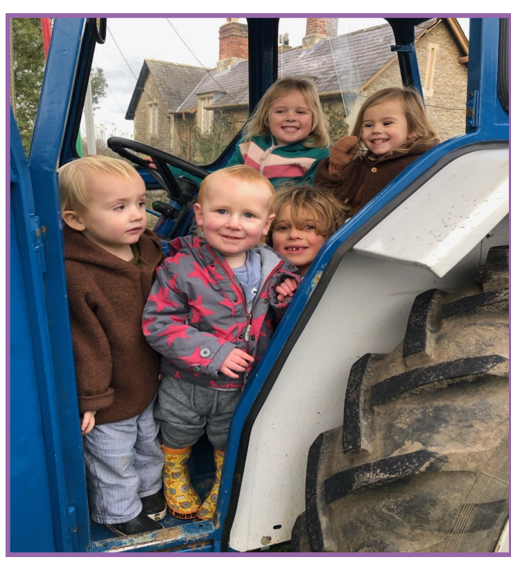
All Saints, Coleshill love to celebrate Plough Sunday and the tractor and plough on the Green attract a lot of a attention. The smiles on the children's faces say it all.

Interested? Get in touch with the Vicar.