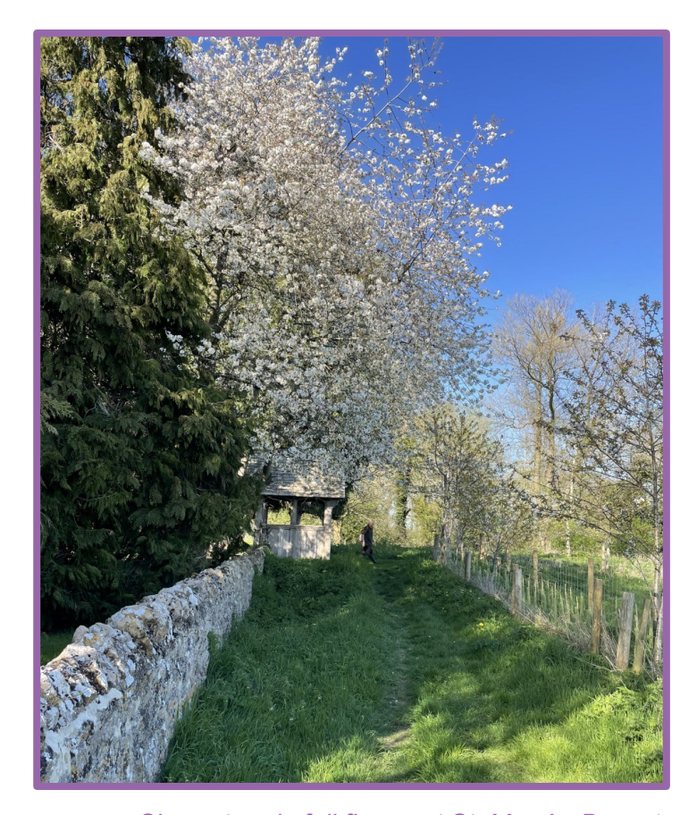
Cherry tree in full flower at St. Mary's, Buscot (above) and (below) Contemplation Garden with views over the Vale of the White Horse