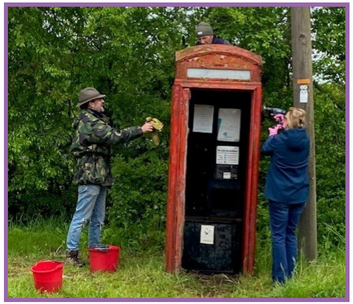
The Big Help Out at Eaton Hastings

"To mark the Coronation "Big Help Out" in Eaton Hastings, villagers got together for coffee and cake on the green at Roadside Cottages, enjoying conversation and contributing to a number of community mini projects. These included cleaning of the redundant BT phone box for future community use, clearing of drains and gullies, grass cutting along paths and litter removal. It was During Holy Week, the Contemplation Garden at an enjoyable morning which set the tone for future Great Coxwell became the venue for the Stations similar activities."