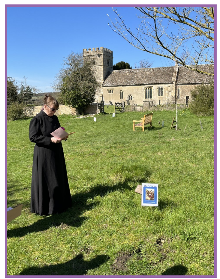
Reflecting upon the 7th station - Jesus falls for the second time

of the Cross. These fourteen stations depicted Christ's last day from when he was condemned to death to being placed into his tomb. The walk, consisting of scripture and reflections, was poignant and meaningful and further blessed by the sun.