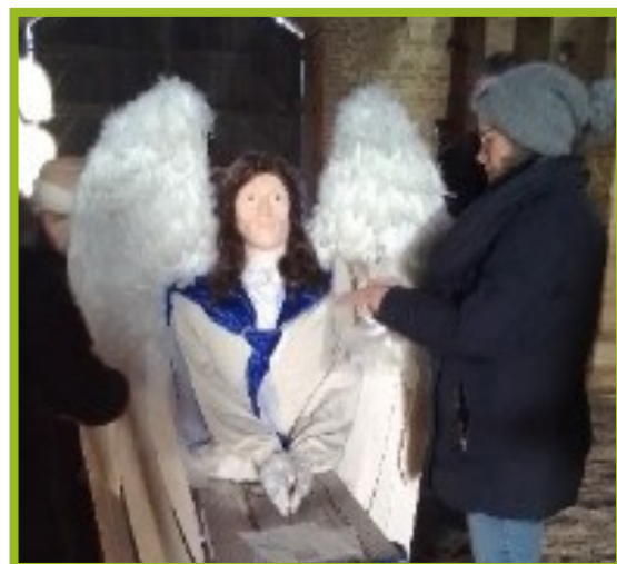
Packing the angel away until next year

Thanks to everyone from all the villagers who helped with the Christmas celebrations.