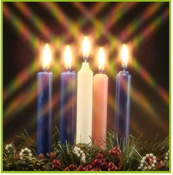
Advent—God's Light is Upon Us