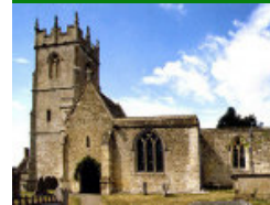
All Saints, Coleshill