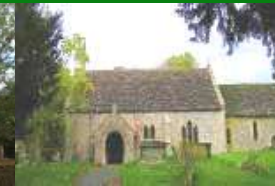
St Michael & All Angels, Eaton Hastings