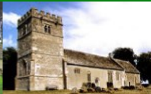
St Giles, Great Coxwell