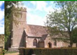
St Mary's, Buscot