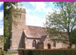
St Mary's, Buscot