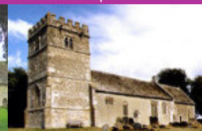
St Giles, Great Coxwell