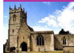
All Saints, Coleshill