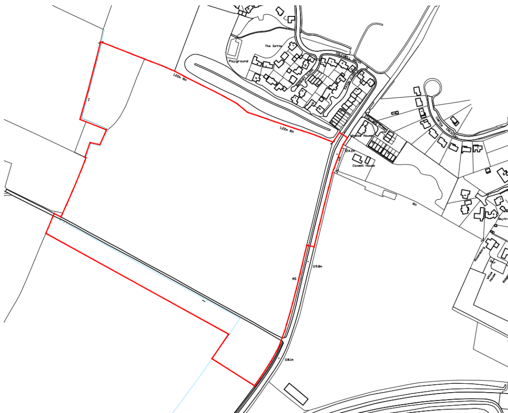
Fig 2, the steeds site and perimeter of the Belway owned land taken in respect of the planning application for 200 houses known as ‘The Steeds’

Issues with retraining these properties in Great Coxwell that have been noted at previous meetings are: