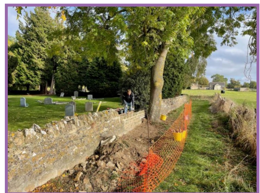
St. Mary's Church yard wall being repaired