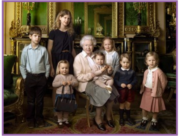
The late Queen Elizabeth II with her grandchildren